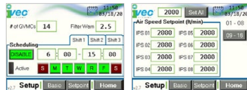
Setup - Basic